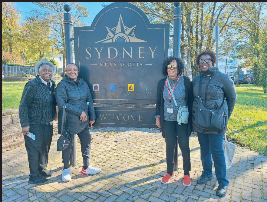
PASR Trip to Nova Scotia

Her contributions are will be always remembered. We will miss her loyalty and selfless contributions to the organization.