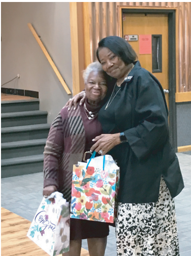
Fall Luncheon 2