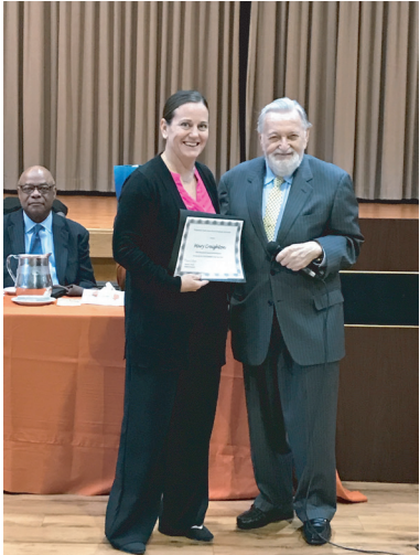
Fall Luncheon 3