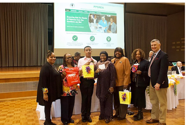
AARP Raffle Winners