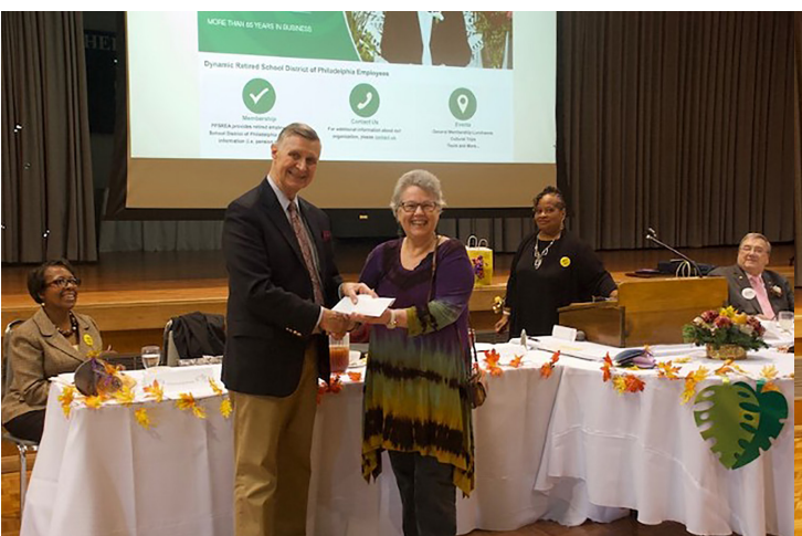
PPSREA Raffle Winner