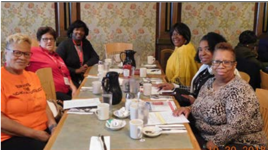
Attendees from Fall 2018 Breakfast