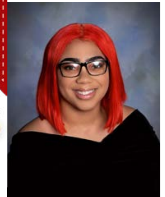
MARCIA M. HARGRAVES HIGH SCHOOL OF THE FUTURE